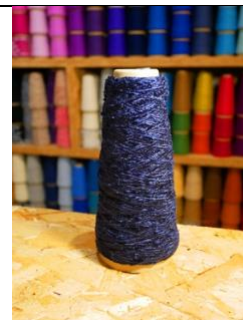
NAVY (CURRENTLY UNAVAILABLE)