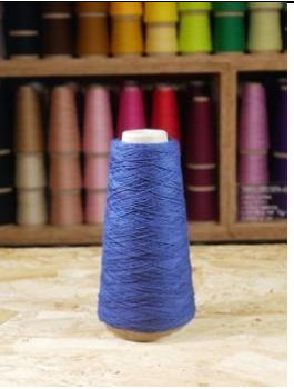
NAVY (NIGHT SKY)